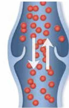
DISEASED VEIN Valves that cannot close allow blood to drain and pool