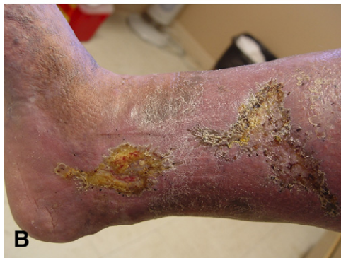
Fig 4. Induration. A, White atrophy. B, Lipodermatosclerosis.