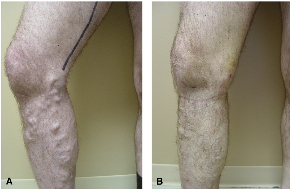
Fig 6. The “visual language” of VCSS. Consistency in physician scoring and reporting allows a common language of venous disease to emerge. A, Before treatment basic clinical CEAP 3-VCSS 7. Revised VCSS scoring as follows: Pain = 1, VV = 2, Edema = 2, Pigmentation = 0, Inflammation = 0, Induration = 0, Active ulcers, size, duration = 0, Compression = 2. Total VCSS = 7. B, After treatment, scoring changes to clinical CEAP 2-VCSS 3. Pain = 0, VV = 1, Edema = 0, Pigmentation = 0, Inflammation = 0, Induration = 0, Active ulcers, size, duration = 0, Compression = 2. Total VCSS = 3.