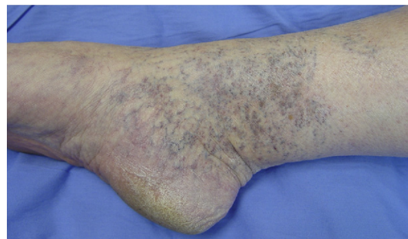
Fig 1. Corona phlebectatica.

Within the second descriptor, varicose veins, the vein size criterion was modified to "at least 3-mm diameter" to remain consistent with the revised CEAP classification. 14 In this definition, "varicose veins" involve any subcutaneous saphenous veins, saphenous tributaries, or nonsaphenous superficial leg veins. The standing position for varicose vein assessment has been clarified in the instructions for use (Table II). Therefore, an overall change in the standing position size of previously engorged or enlarged veins may affect the score of this section if those veins shrink to less than 3 mm in diameter. Varicosities that are confined to either the calf or thigh are distinguished from varicosities that are present in both the calf and thigh. Great saphenous varicose vein distributions are not differentiated from small saphenous vein distributions in this revised version. Telangiectasias and reticular veins are still not included and remain without a score. Corona phlebectatica (ankle flare) is defined as more than five blue telangiectasias on the inner or outer edge of the foot. Corona phlebectatica is associated with chronic venous insufficiency (CVI) and perforator reflux 20 but is not truly "skin pigmentation," which is defined by the revised CEAP classification as "brownish darkening of skin, resulting from extravasated blood." 14