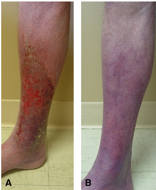
Fig 7. A , Before treatment clinical C4 -VCSS 16. Pain = 2, VV = 1, Edema = 2, Pigmentation = 3, Inflammation = 3, Induration = 3, Active ulcers, size, duration = 0, Compression = 2. Total VCSS = 16. B , Four months after treatment, patient remains clinical C4, but C4-V9. Pain = 0, VV = 1, Edema = 1, Pigmentation = 3, Inflammation = 0, Induration = 2, Active ulcers, size, duration = 0, Compression = 2. Total VCSS = 9.