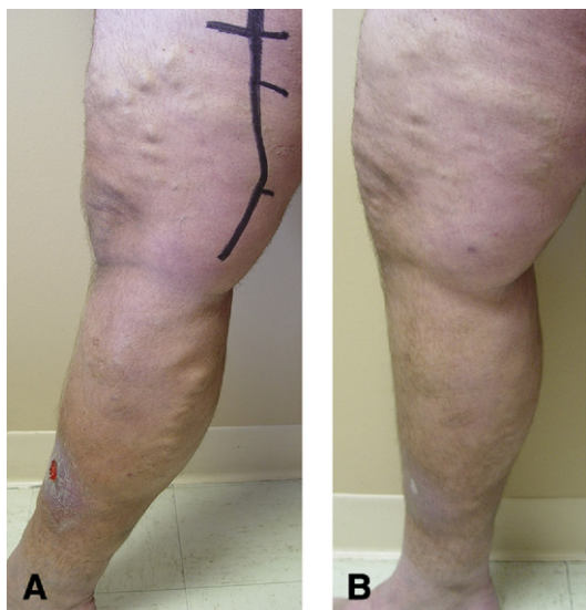
Fig 8. A , Prior to treatment, clinical C6-V18. Pain = 3, VV = 3, Edema = 2, Pigmentation = 3, Inflammation = 1, Induration = 2, Active ulcers = 1, size = 1, duration = 1, Compression = 1. Total VCSS = 18. B , One month after treatment, clinical C5-V11. Pain = 1, VV = 2, Edema = 1, Pigmentation = 3, Inflammation = 0, Induration = 2, Active ulcers = 0, size = 0, duration = 0, Compression = 2. Total VCSS = 11.