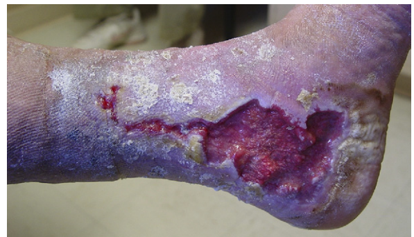
Fig 5. Number of active ulcers ( remains 1 ulcer in healing phase ).

diminishing signs and symptoms; the clinical status of patients with class 2 and class 3 level disease varies widely. Linking the VCSS to the clinical CEAP conveys a large amount of complementary information that enhances communication. Figs 6 through 9 illustrate a more vivid and dynamic clinical picture.